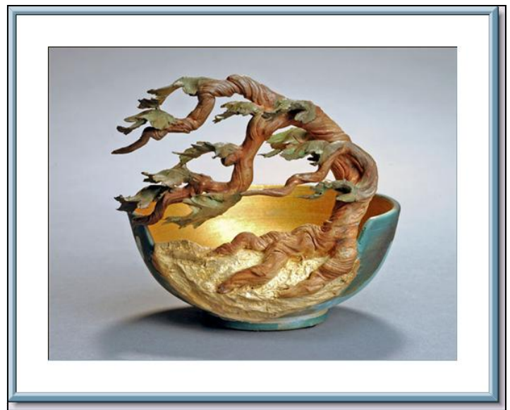
Hand thrown ceramic bowl with attached cut-out by Bonnie Belt www.silverbonsai.com