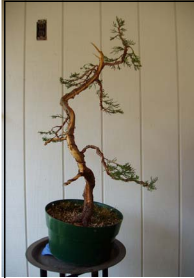
The same tree after styling