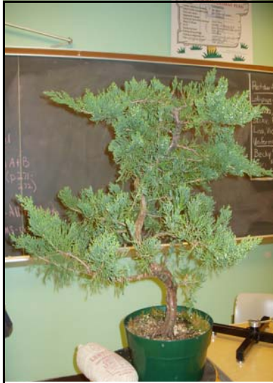
Cheryl selected this nursery stock for its "wonderful curves"