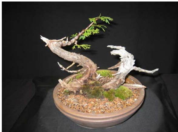
Dave Tettemar's 15-year-old white cedar, a popular display tree at this year's MidAtlantic Conference.