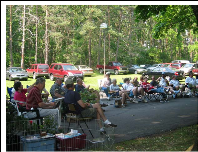
A classic June day for the BSLV auction/picnic

I hope they didn't spend all my biscuit money on bonsai stuff!!!!!!