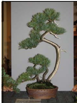
4th Place-Roger Krauss's Japanese white pine

These are just some of the beautiful trees on display at Neighbor's Home and Garden Nursery in October. The People's Choice Awards went to: