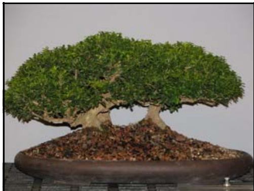
Tied for 6th Place-Jim Heacock's Kingsville boxwood