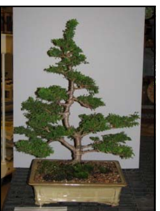
Tied for 6th Place-Tom Bender's dwarf hinoki cypress