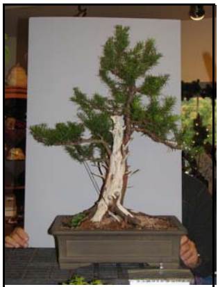
3rd Place-Jim Heacock's yew