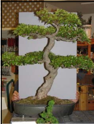
Tied for First Place-Dave Tetteimer's azalea