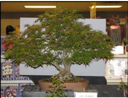
Tied for First Place-Jim Brant's triple-trunk maple